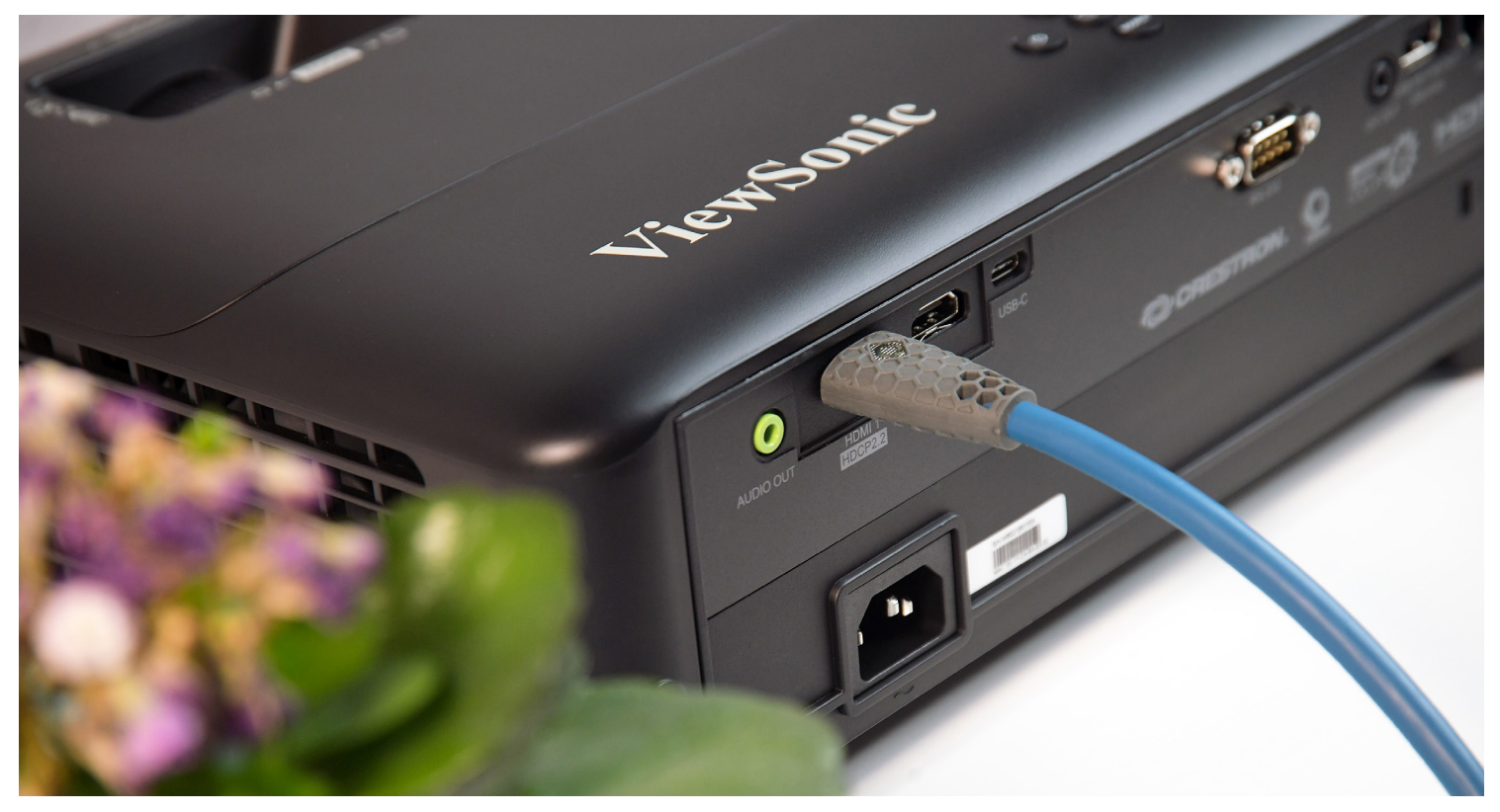
The Oehlbach Flex Evolution performs well with 4K projectors like the ViewSonic PX728-4K. It transmits all image signals completely free of interference. The sound is transmitted from the projector to the AV receiver via eARC. This is practical if the ViewSonic is to receive apps and the sound is to be played back from the 5.1 system.