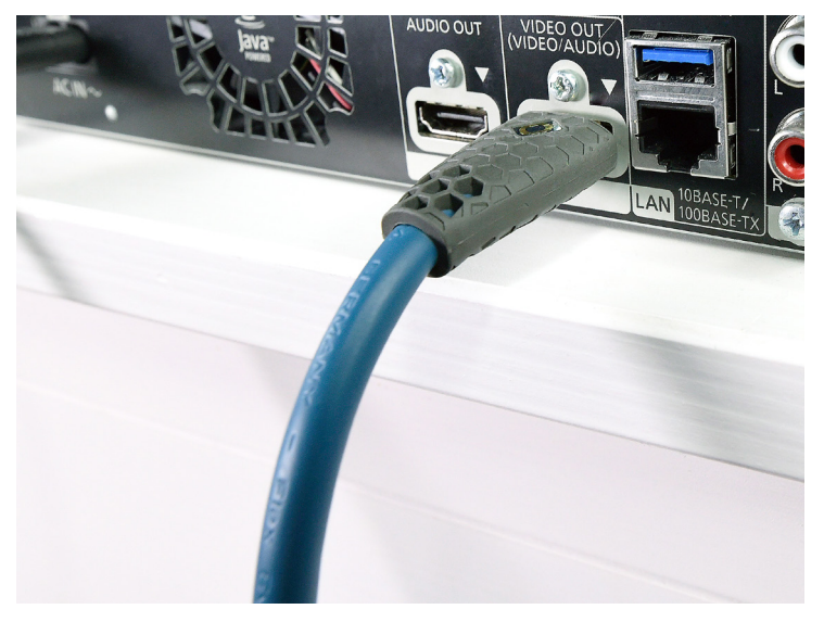
The flexible housing protects the cable and reduces the risk of cable breakage. Especially when space is tight during installation and the cable is to be routed downwards or sideways in tight curves. Photo: Michael B. Rehders

The Ultra High-Speed HDMI cable from Oehlbach is available in two lengths: In one meter and three meters. Both support the highest HDMI standard currently available. Photo: Michael B. Rehders