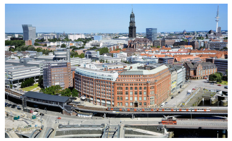
Even my 8K panorama shot of Hamburg is completely transmitted by the Oehlbach Flex Evolution. The screenshot from the screen proves that the high resolution is transmitted completely and true to the original.

Where some other HDMI cables already have problems transmitting the feature film "Gemini Man" at 4K/60 Hz without errors, the Oehlbach Flex Evolution, on the other hand, does not show any weakness. The movie runs absolutely smoothly in 60 Hz. As expected, everything that was fed into the HDMI cable at the beginning arrives correctly at the projector. Artifacts in the form of interference, which can be traced back to the HDMI signal transmission, do not exist with the Oehlbach. Influences from smartphones, antenna cables and WiFi sticks leave our test sample completely unimpressed. It does what it is supposed to: Transmit signals circumferentially and without interference. Henry Brogan (Will Smith) is a contract killer with extraordinary abilities. His way of working is precise and he completes his missions in the shortest possible time. When he is pursued by his cloned younger self on a motorcycle, crazy fast camera pans occur. The projector and HDMI cable show up with aplomb. Everything is crystal clear on the screen. It doesn't get any better than this.